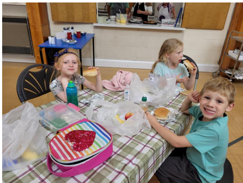
Lunch and arts-and-crafts at Foxwood Community Centre during our summer 2022 HAF session

The Holiday Activities and Food Programme (HAF) is holiday provision for school-aged children from reception to year 11 who receive benefits-related free school meals. These holiday activities are available during the Easter, summer, and Christmas school holidays and include a nutritious meal along with a variety of enriching activities.